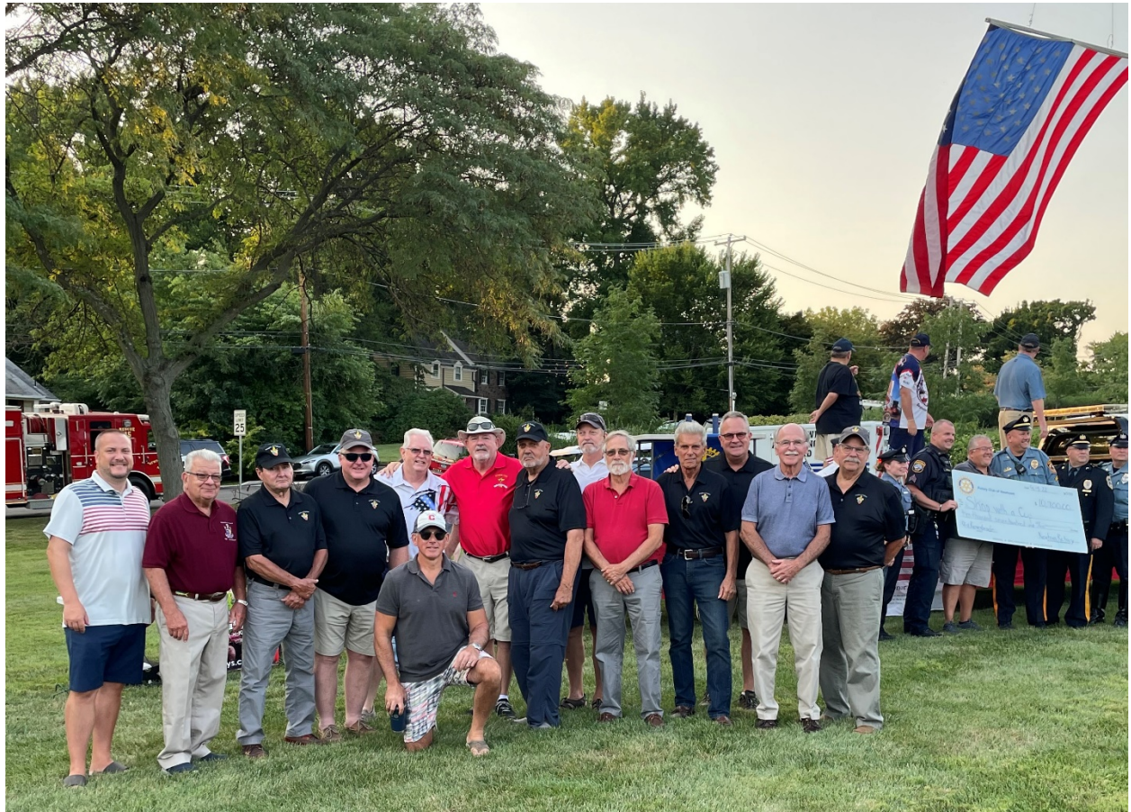
14 members of Defiance Lodge #335 attended the 9/11 Memorial on Friday 9/9 in Newtown, PA.